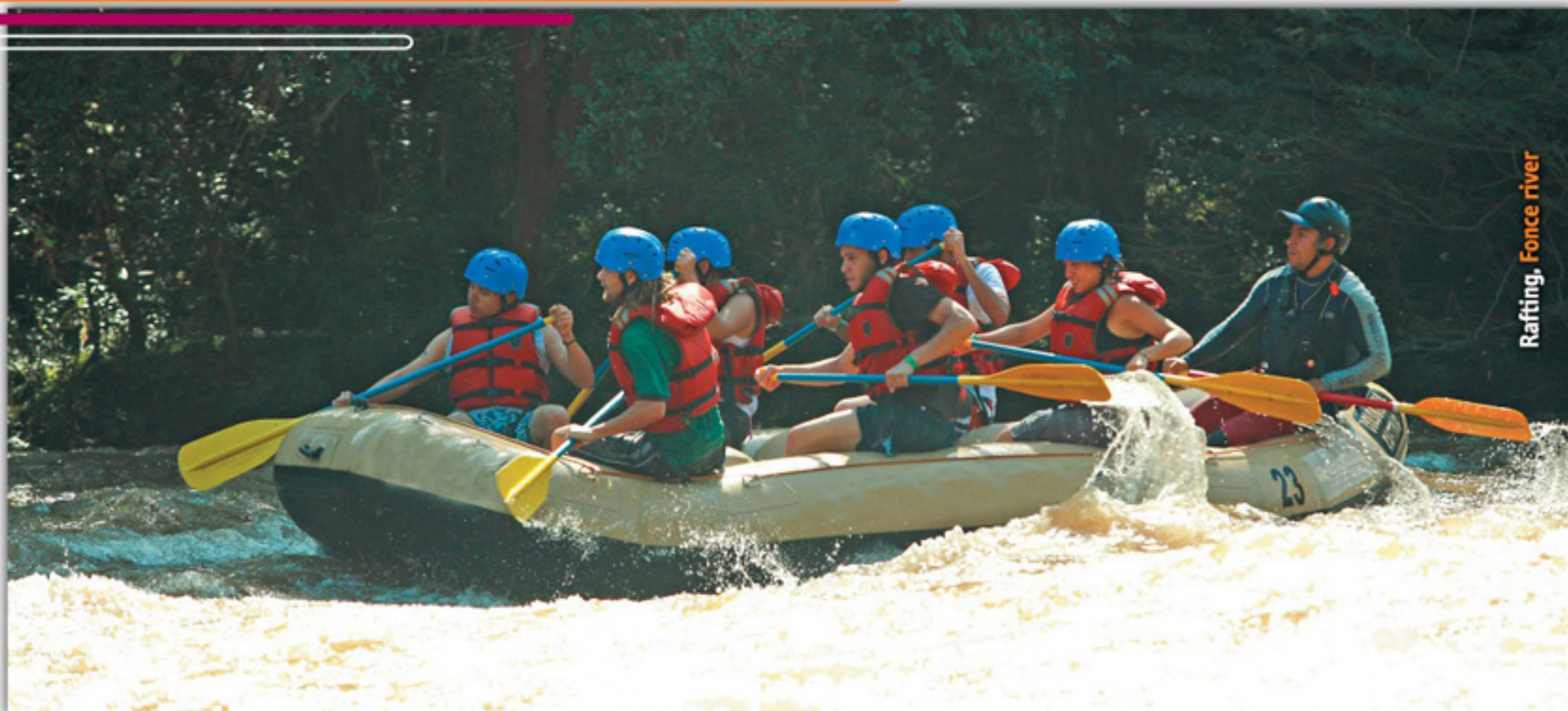
Rafting, Fonce river