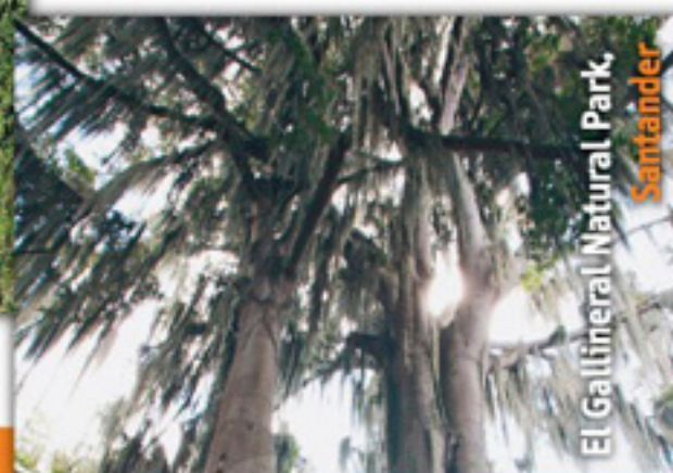
El Gallineral Natural Park, Santander