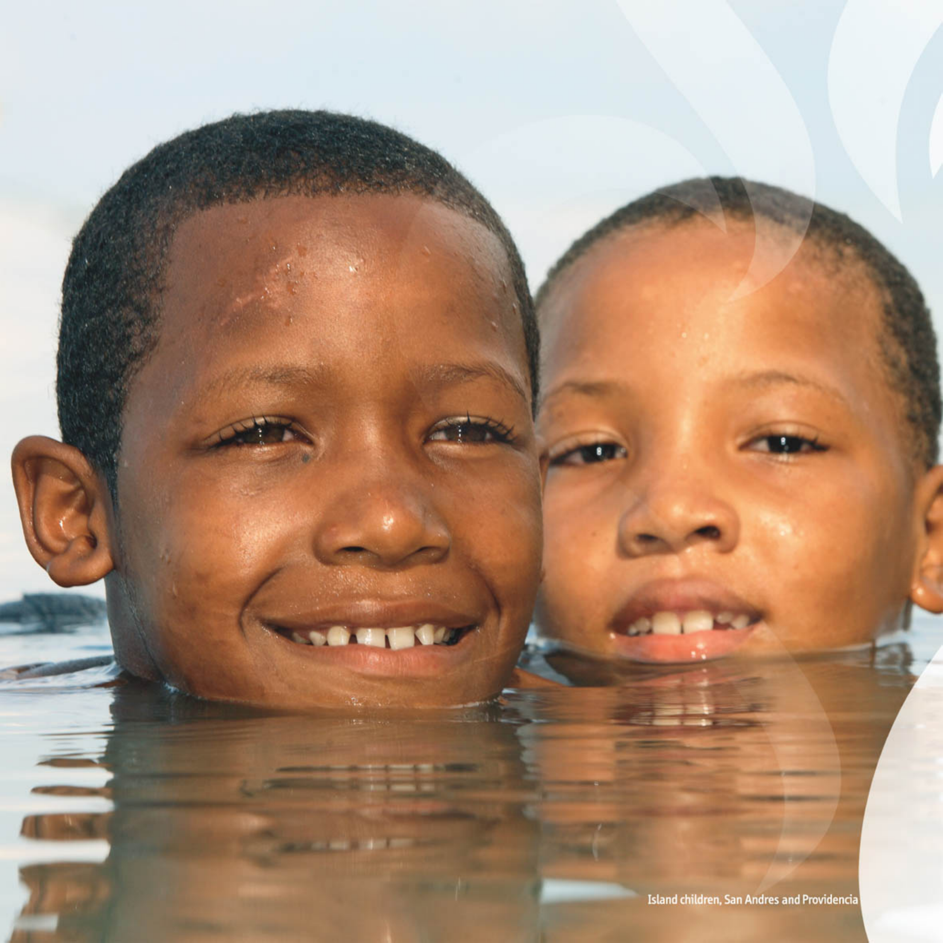
Island children, San Andres and Providencia