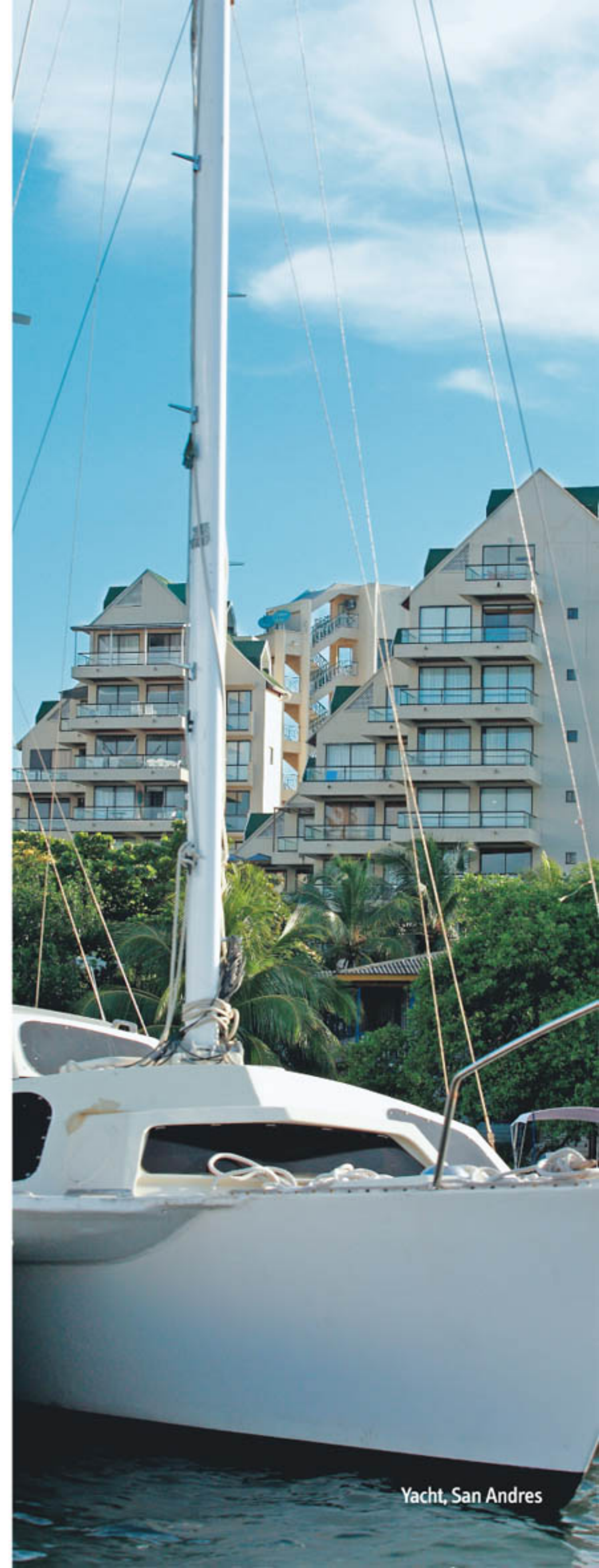
Yacht, San Andres