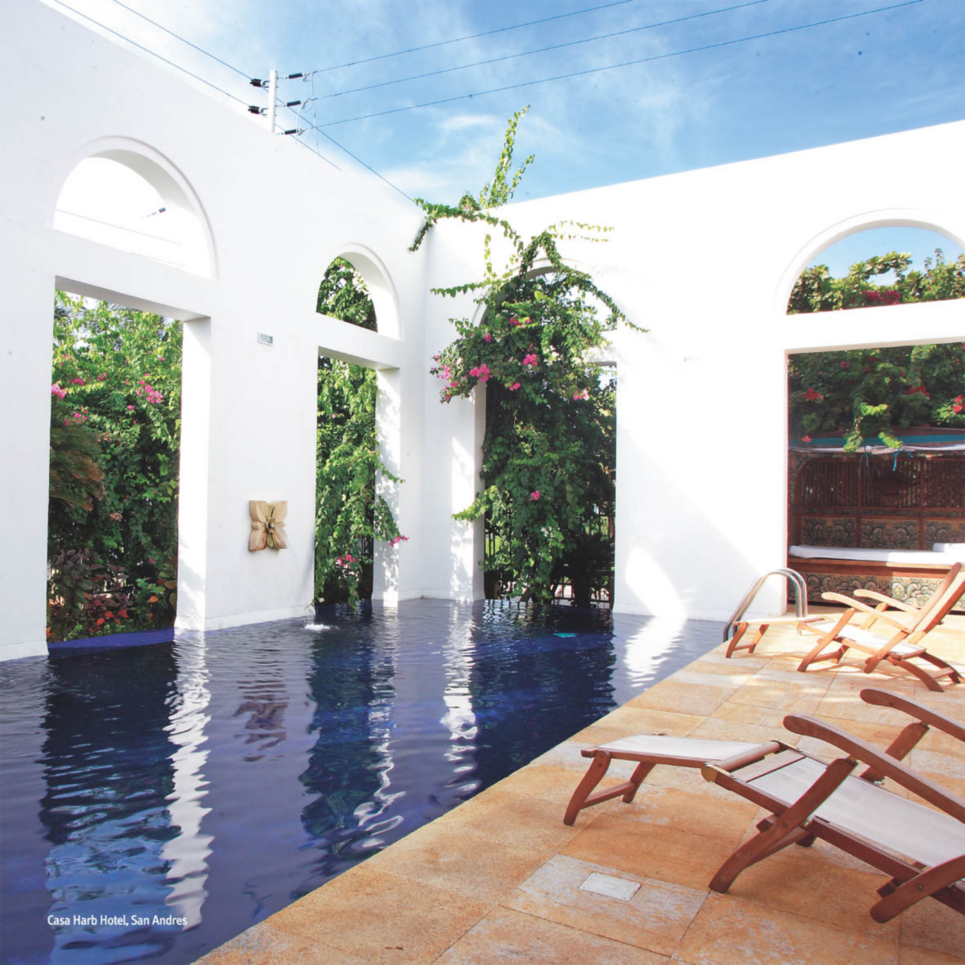
Casa Harb Hotel, San Andres