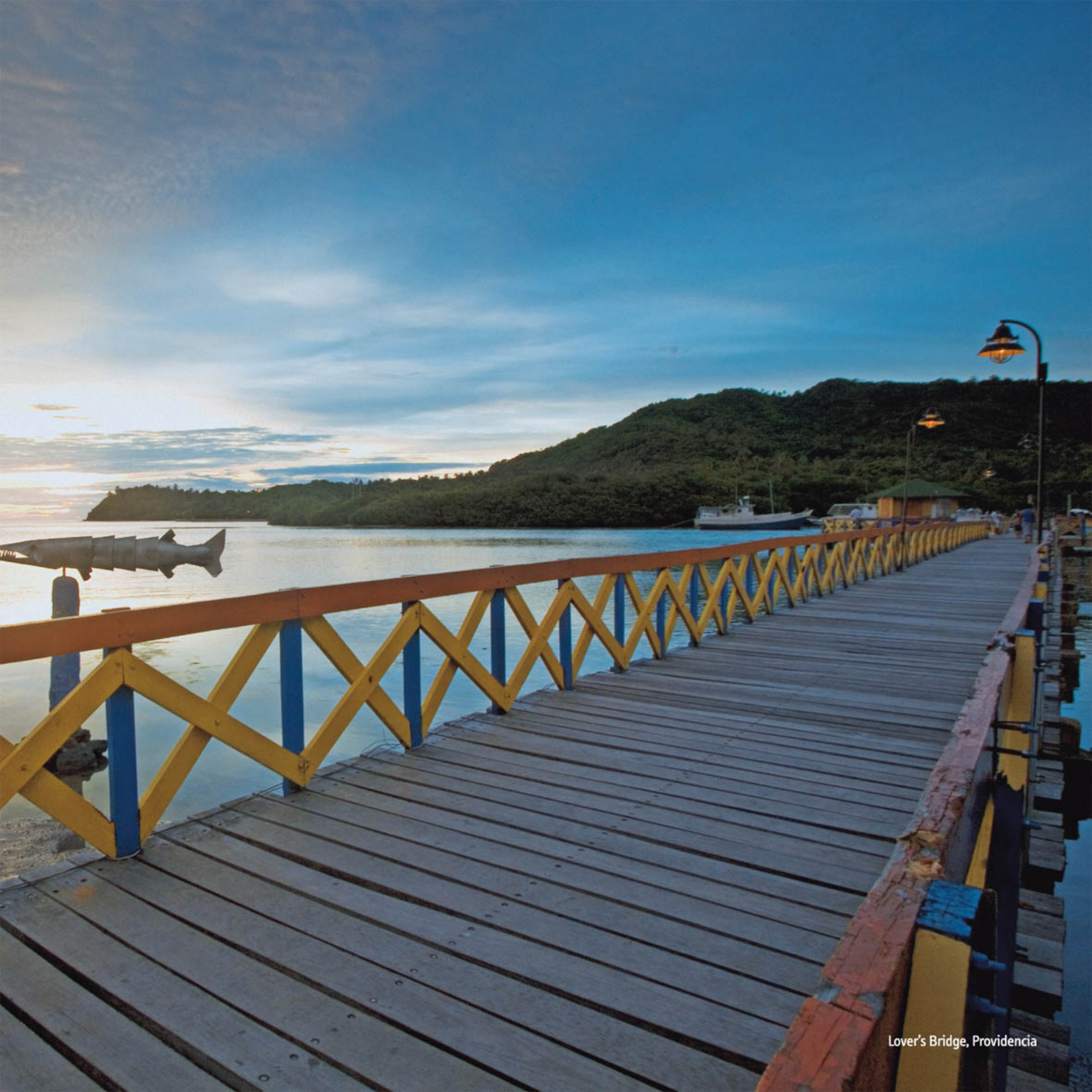
Lover's Bridge, Providencia