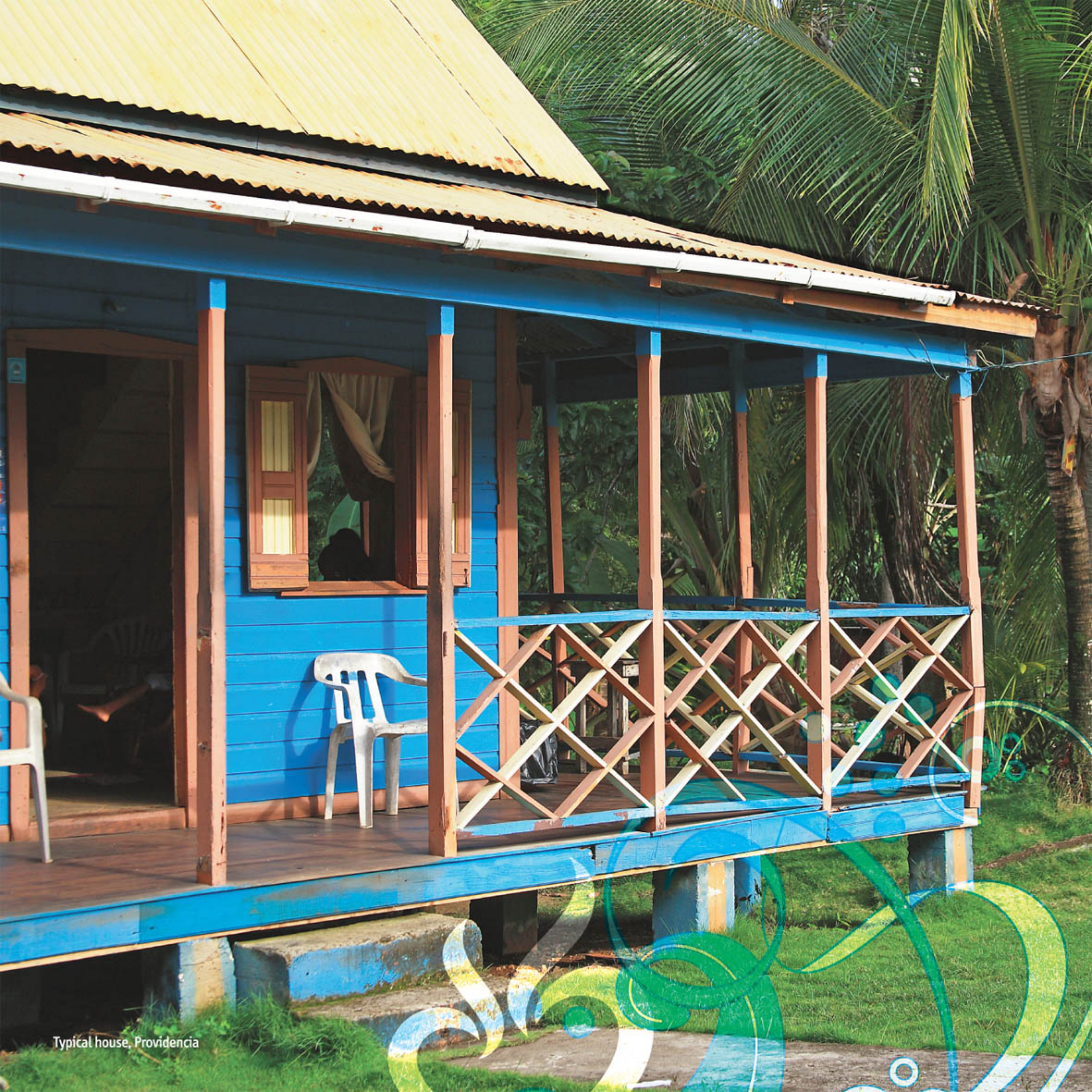
Typical house, Providencia