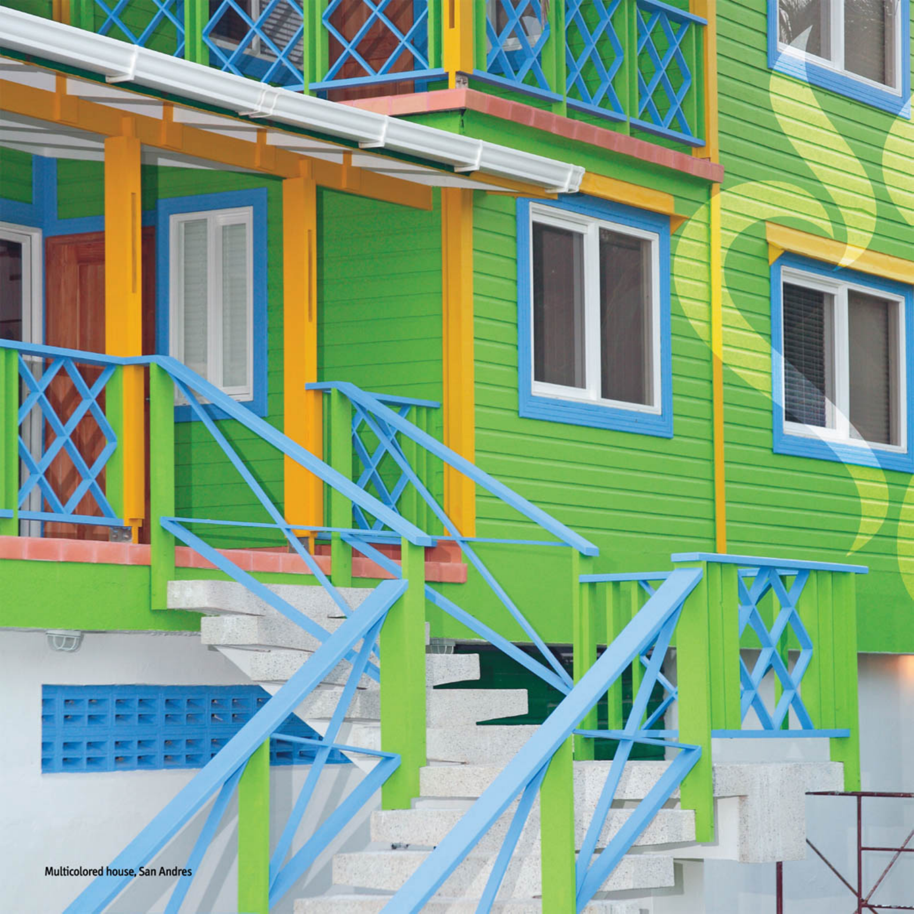
Multicolored house, San Andres