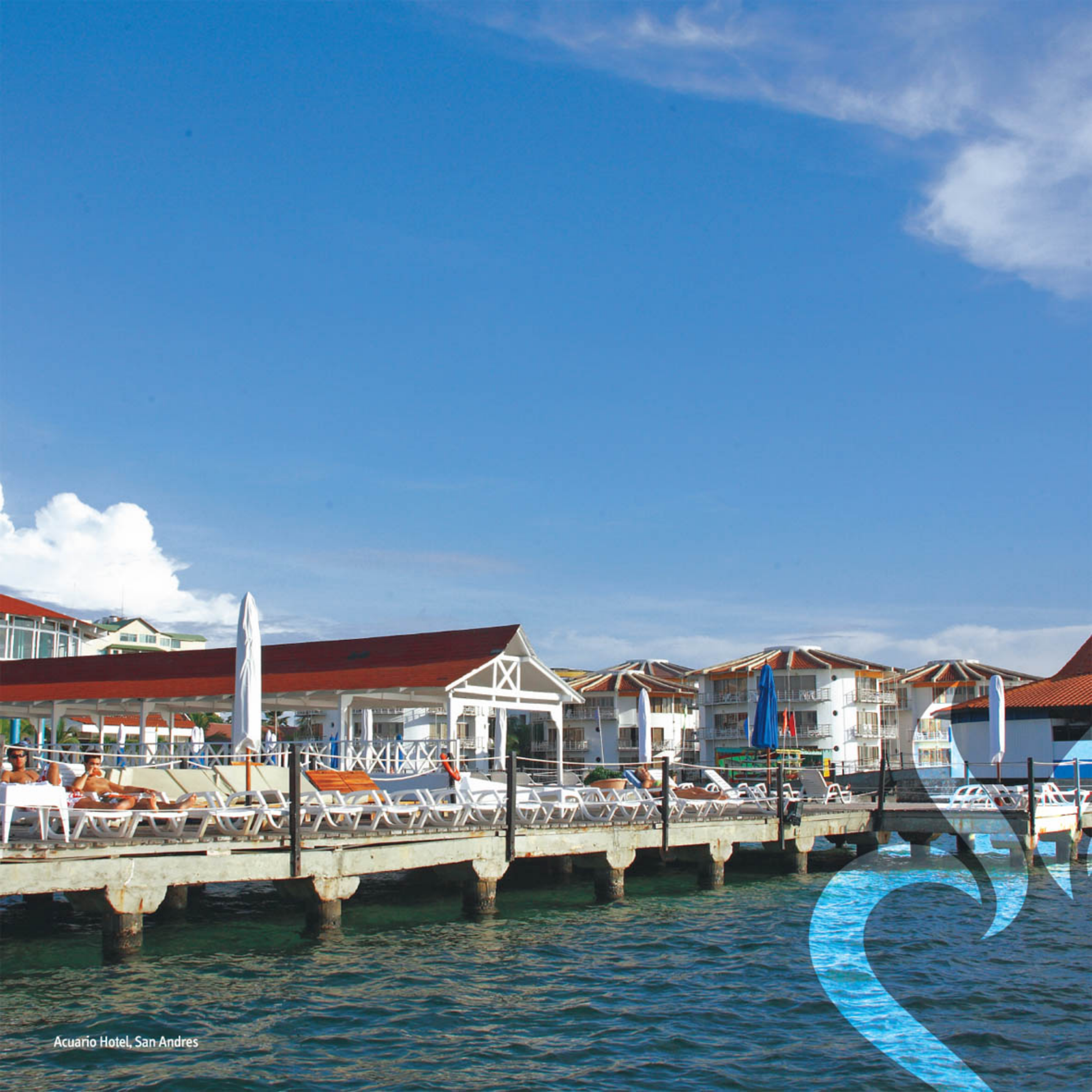
Acuario Hotel, San Andres