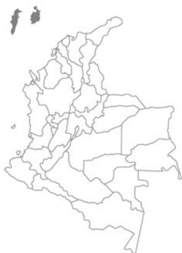
San Andres, Providencia and Santa Catalina