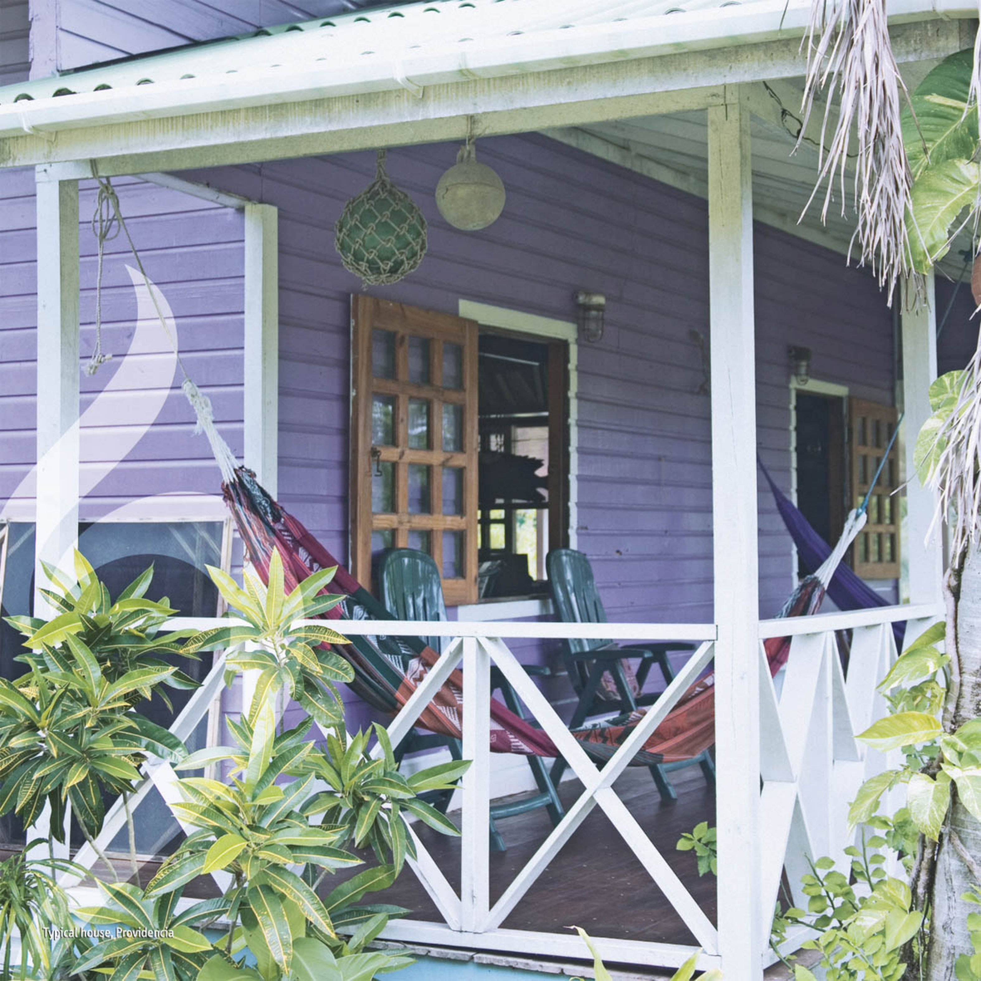
Typical house, Providencia