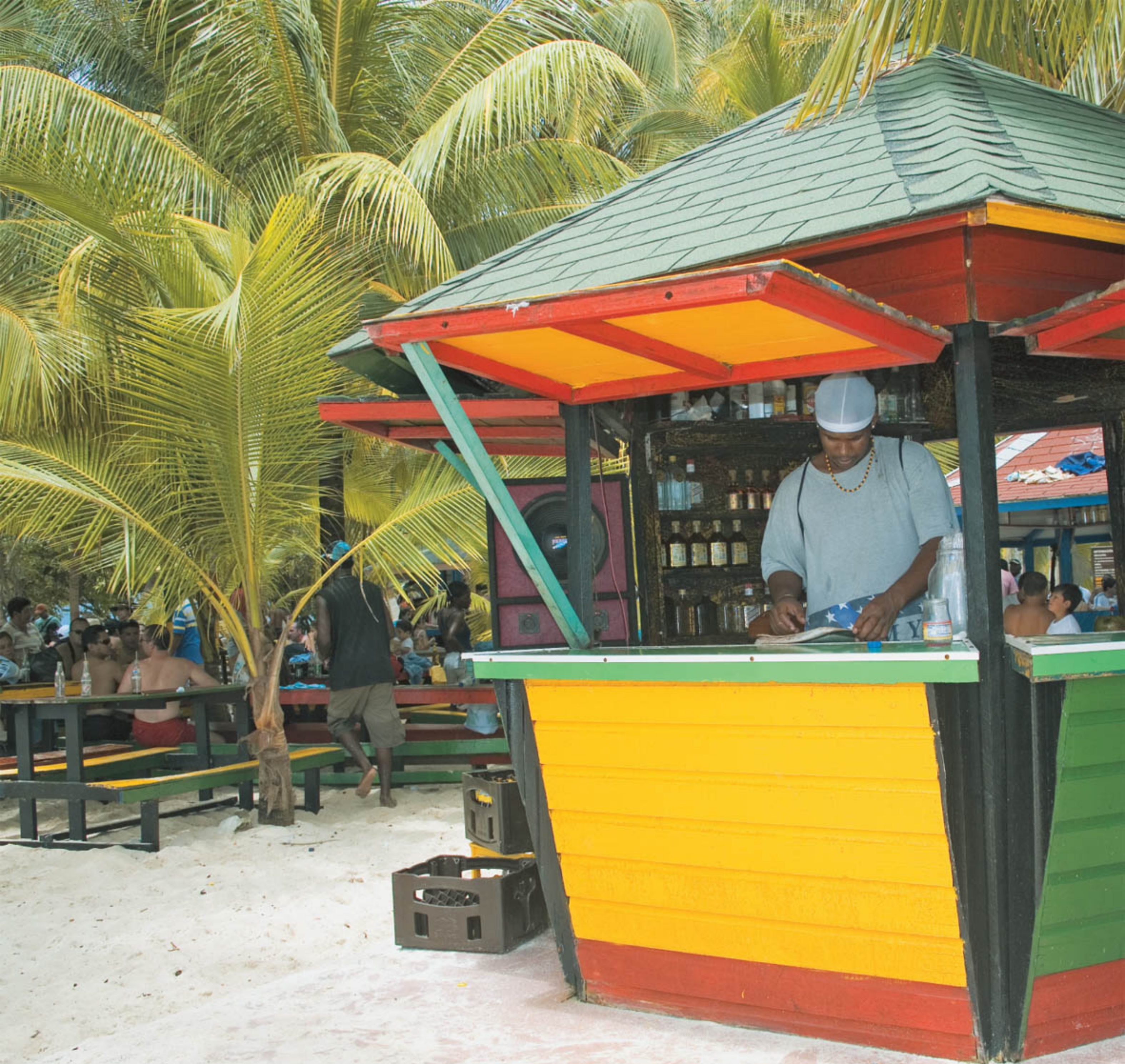
Kiosk on the beach, Johnny Cay