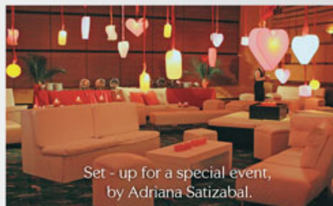
Set - up for a special event