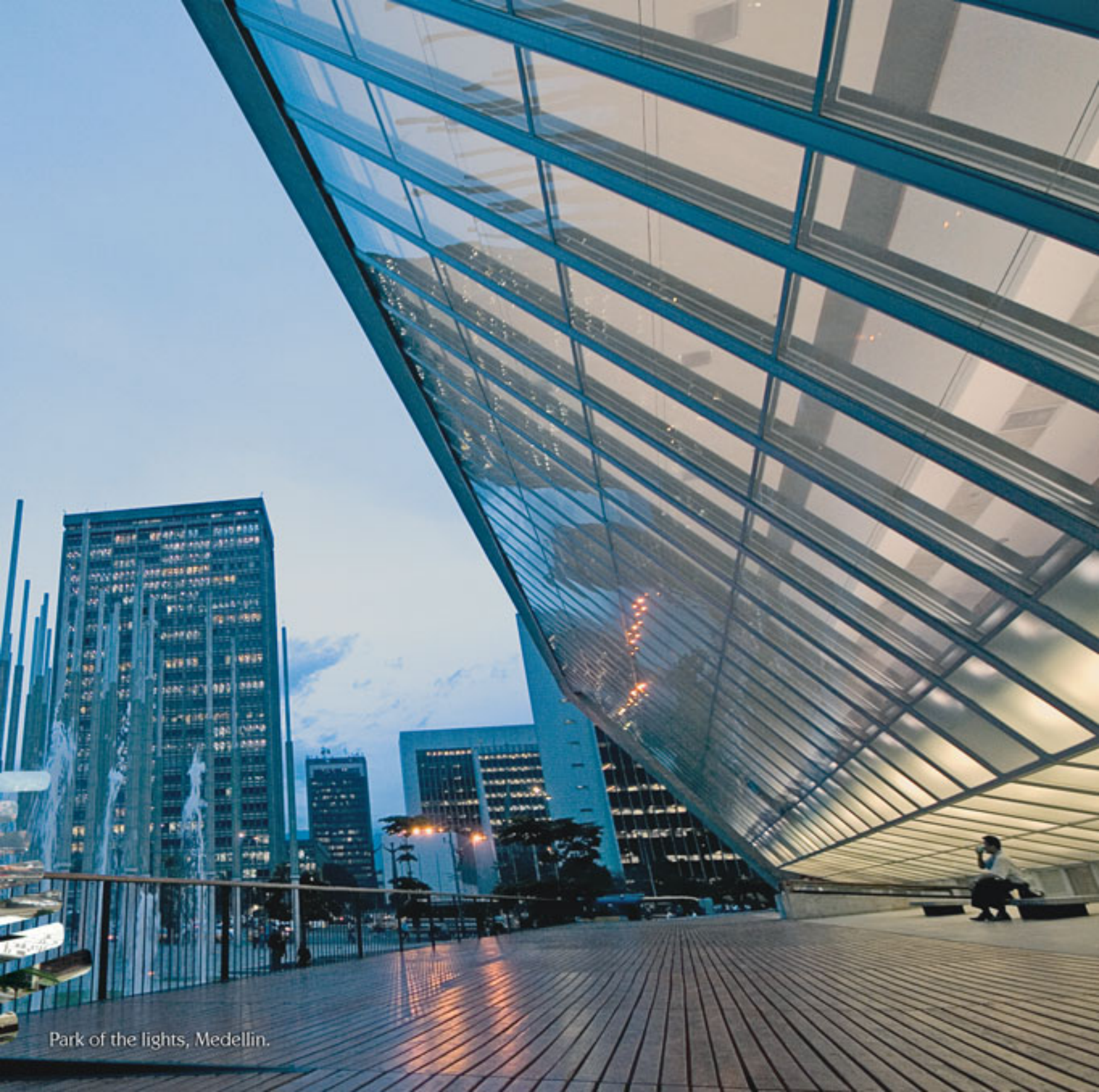
Park of the lights, Medellín.