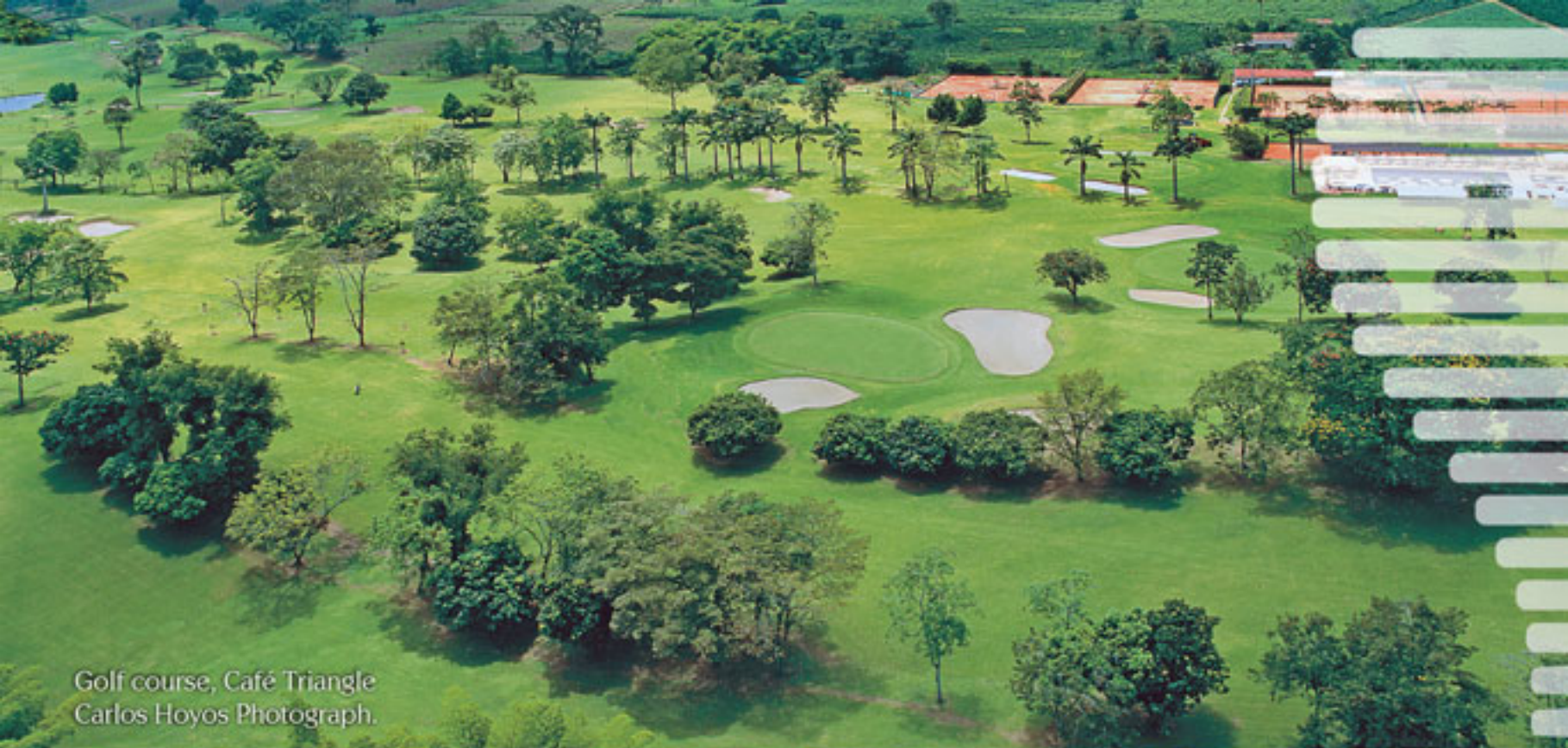
Golf course, Café Triangle Carlos Hoyos Photograph.