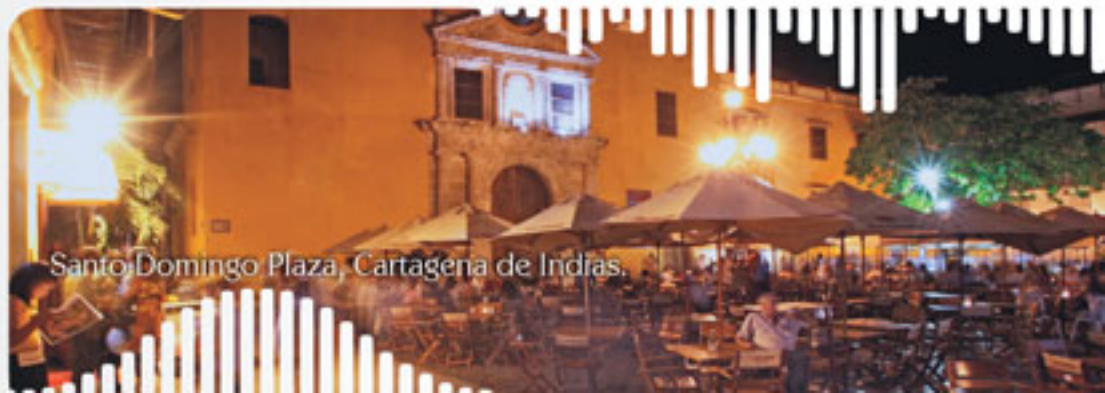
Santo Domingo Plaza, Cartagena de Indias.

Nights in Cartagena de Indias are famous for their romanticism, charm, liveliness, and party atmosphere. Following a tour in the heart of the walled city and its surroundings in a horse-pulled carriage or on a chiva (the famous open-sided bus), visitors can delight a Caribbean or an international cuisine in a multitude of restaurants, several of which are located on a bastion, in a museum, or in a plaza in front of a seventeenth century church. Son, salsa, and crossover rhythms played by folk music groups or professional musicians may be enjoyed in bars, discos, and even on the bastions. All of these have been part of the settings for countless corporate events and incentive trips.