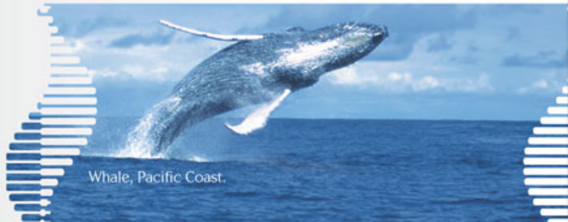
Whale, Pacific Coast.

The events schedule from December 25 to 30 is tight. All of the following take place in those six short days during the Cali Fair: bullfights, horseback rides on the streets, parades of antique and carnival cars, the National Salsa Dancing Contest, the Tascas, the Panamerican Sugar Cane Beauty Pageant, and the Super Concert with the best salsa orchestras in the whole world. These are some the most vivid expressions of the Cali culture.