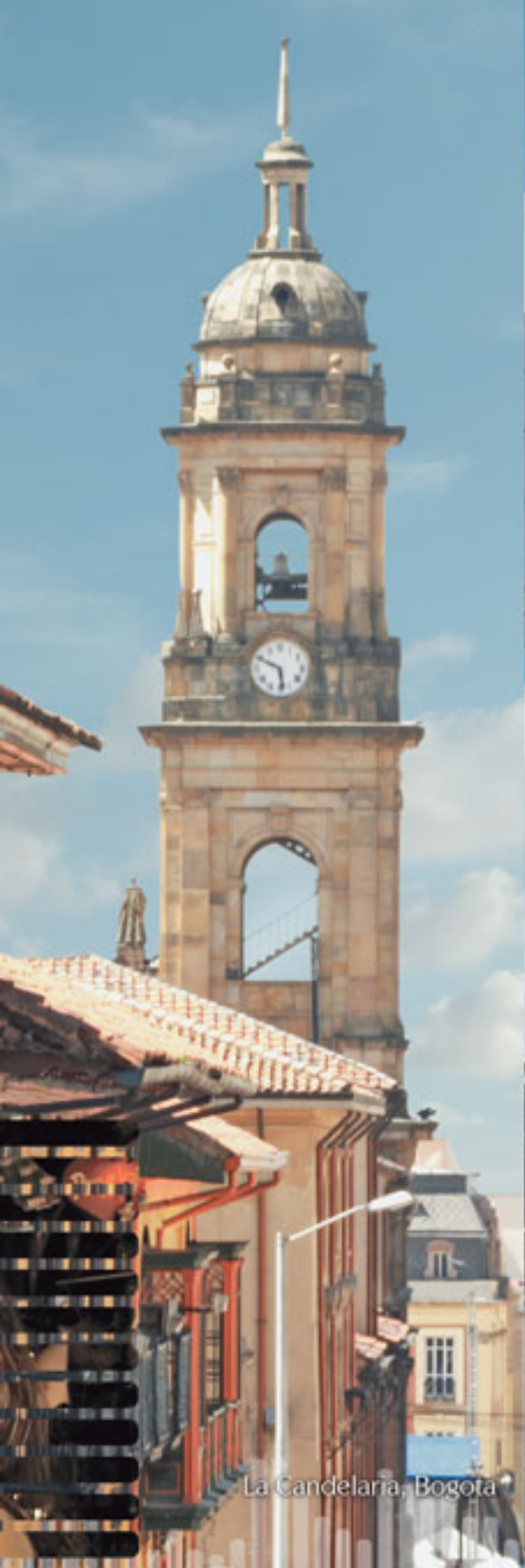
La Candelaria, Bogota