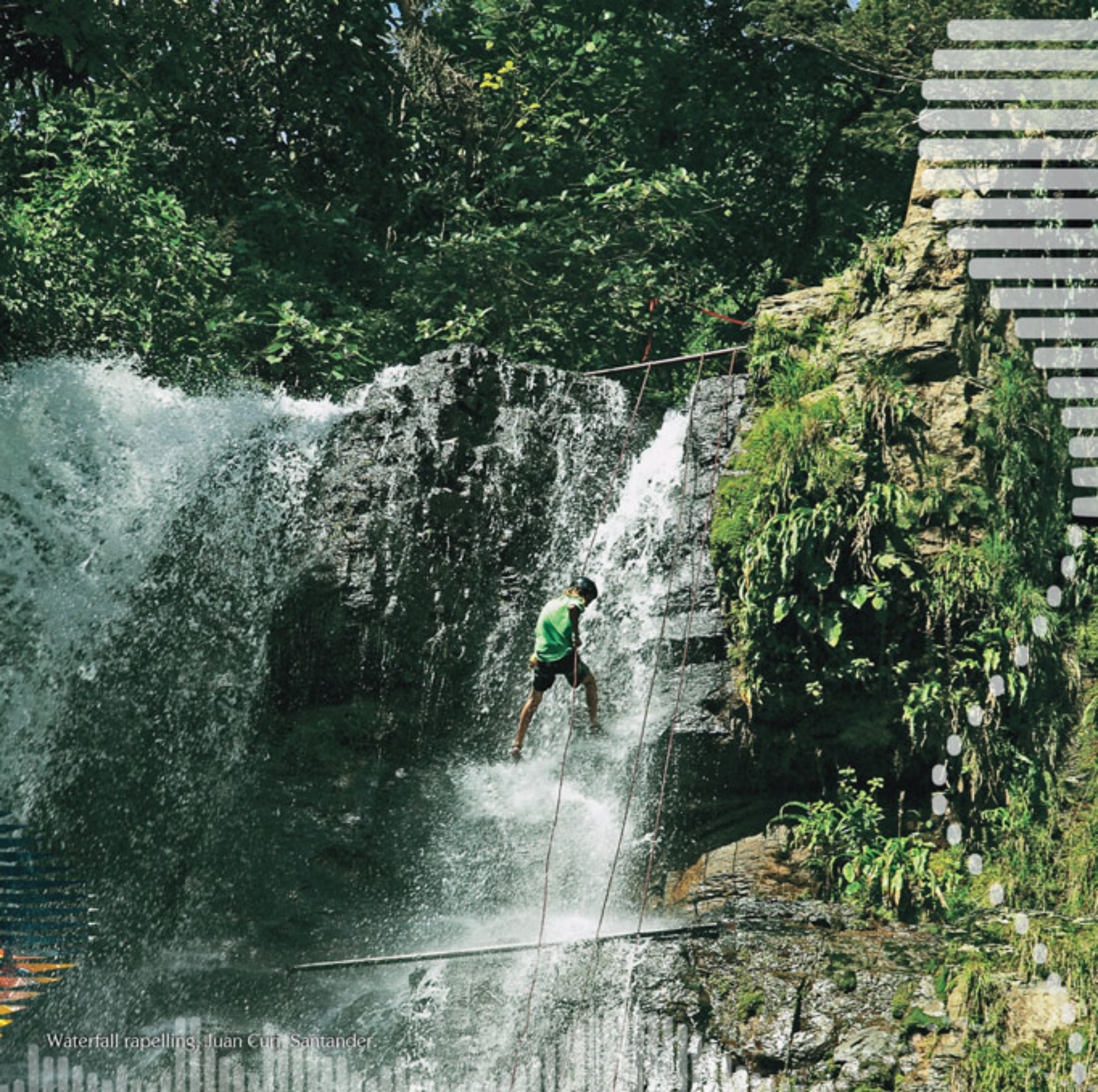
Waterfall rapelling, Juan Curi, Santander