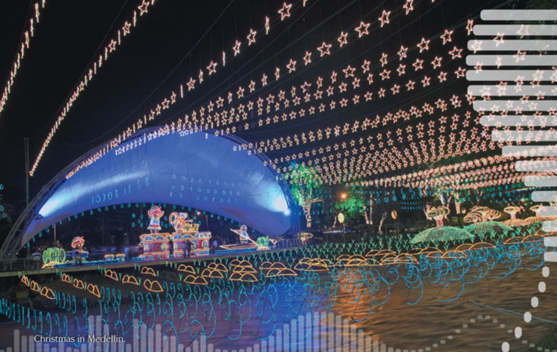
Christmas in Medellín.