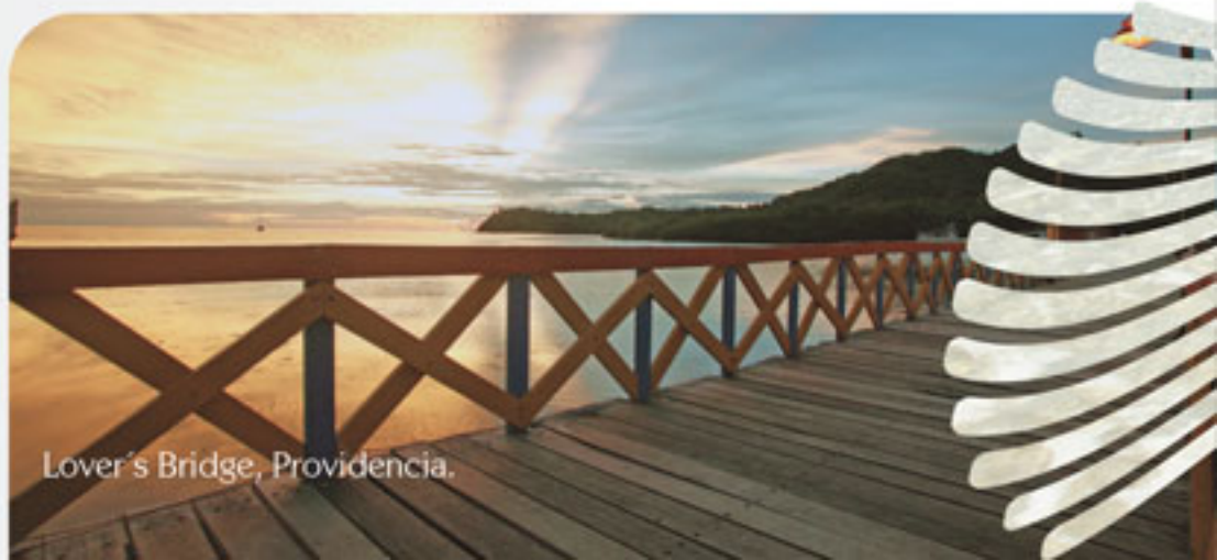
Lover's Bridge, Providencia.

The neighboring island of Providencia, is surrounded by a coral reef and joined to the island of Santa Catalina by the Lovers' Bridge. The beauty of the three islands is truly exuberant; they constitute a great option for incentive trips for small groups.