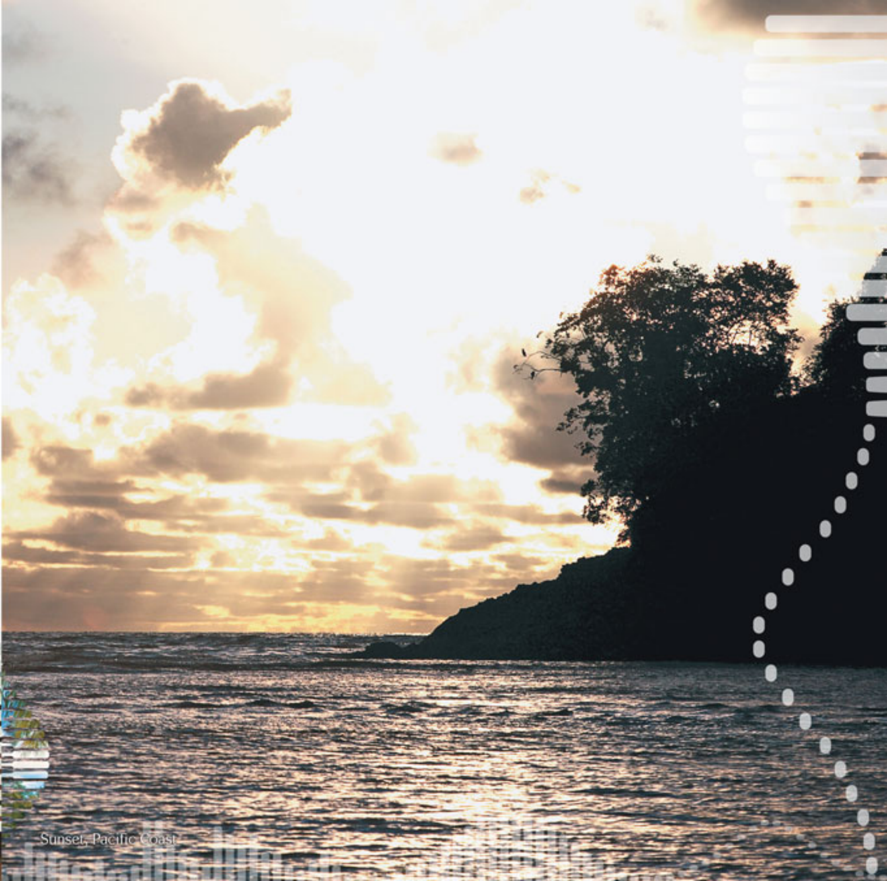
Sunset, Pacific Coast