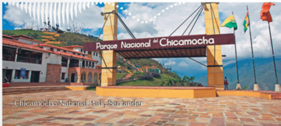
Chicamocha National Park, Santander