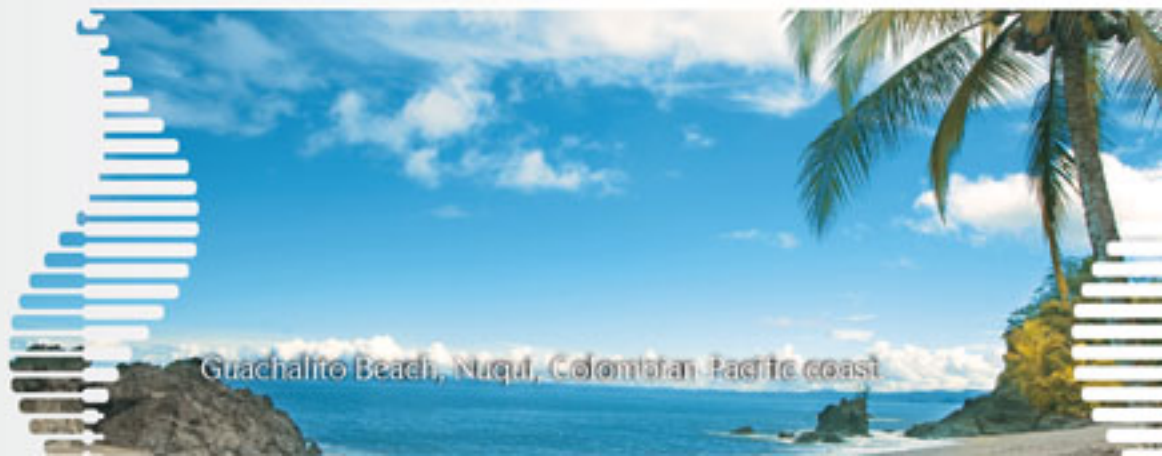
Grachalito Beach, Nuquí, Colombian Pacific coast

Two factors make Valle del Cauca a first rate destination for aerial sports: the presence of winds coming from the Pacific Ocean and the two mountain ranges that cross the destination. Specialized instructors accompany practitioners of paragliding, ala delta, and parachuting on these experiences that seek to conquer the heavens in what many call the Paradise Destination. Sites in the municipalities of El Cerrito, Ginebra, Buga, Guacari, and Palmira have been especially adapted for these sports.