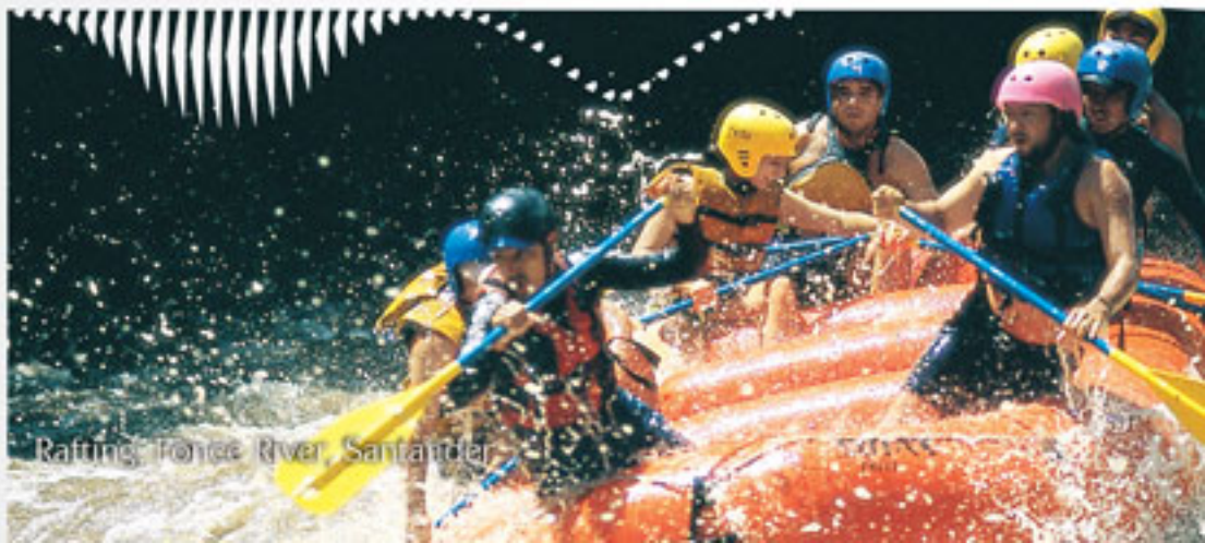
Rafting, Fonce River, Santander

Words are not enough to describe white water rafting on the Fonce River, cave exploration in the Cueva del Indio, and a chiva tour from Floridablanca to San Gil to Giron and Barichara, known as "the prettiest village in Colombia".