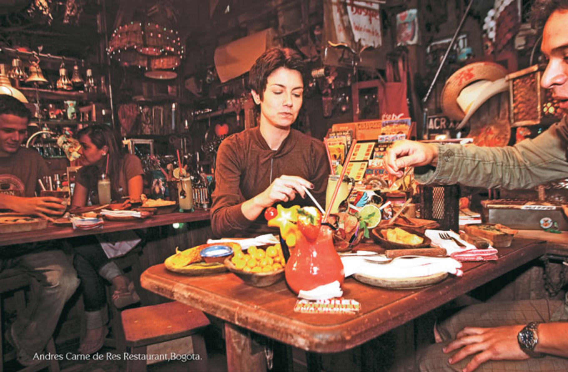
Andres Carne de Res Restaurant, Bogota.