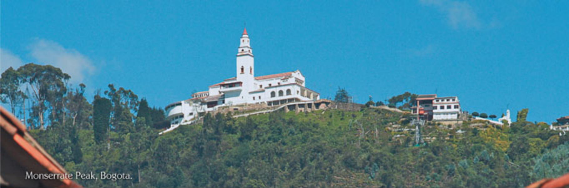
Monserate Peak, Bogota.