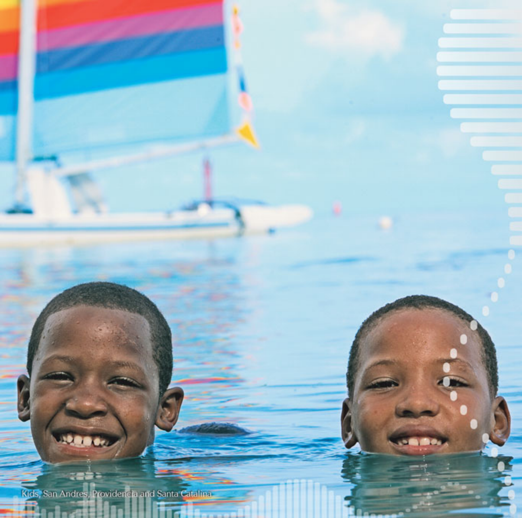
Kids, San Andres, Providencia and Santa Catalina