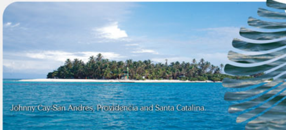
Johnny Cay-San Andres, Providencia and Santa Catalina.

Admiring marine fauna and flora on a tour of the cays and mangroves from a pirate galleon or semi-submersible or glass-bottomed boats is one of the main attractions in this Caribbean destination.