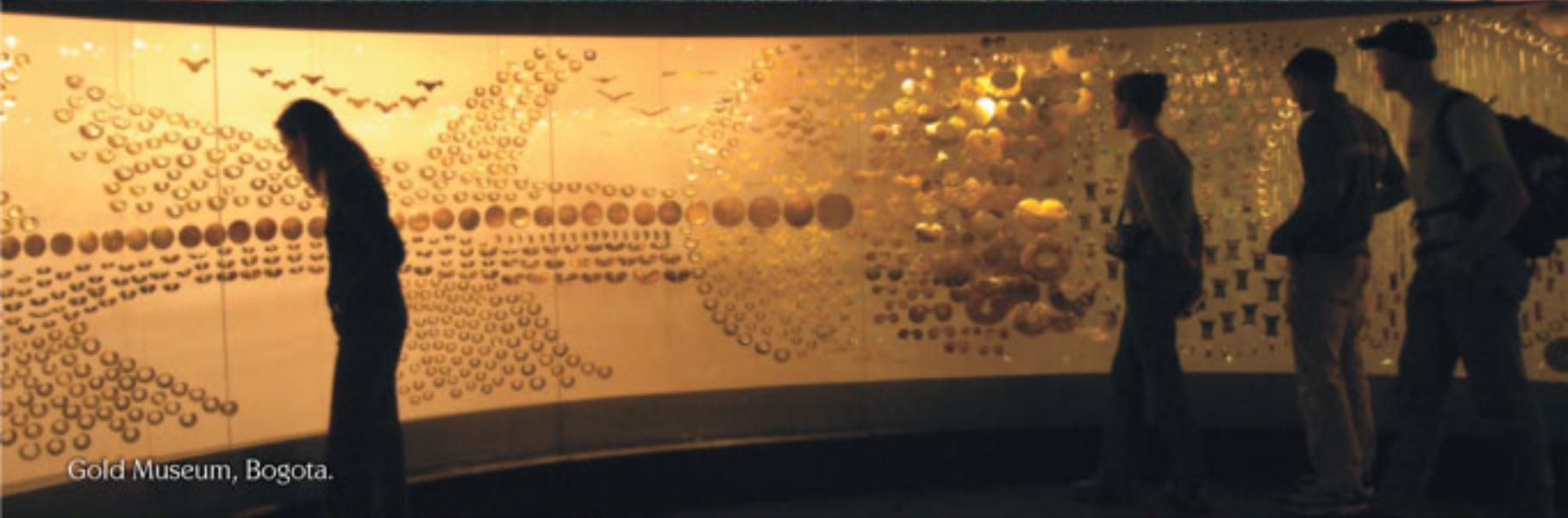
Gold Museum, Bogota.