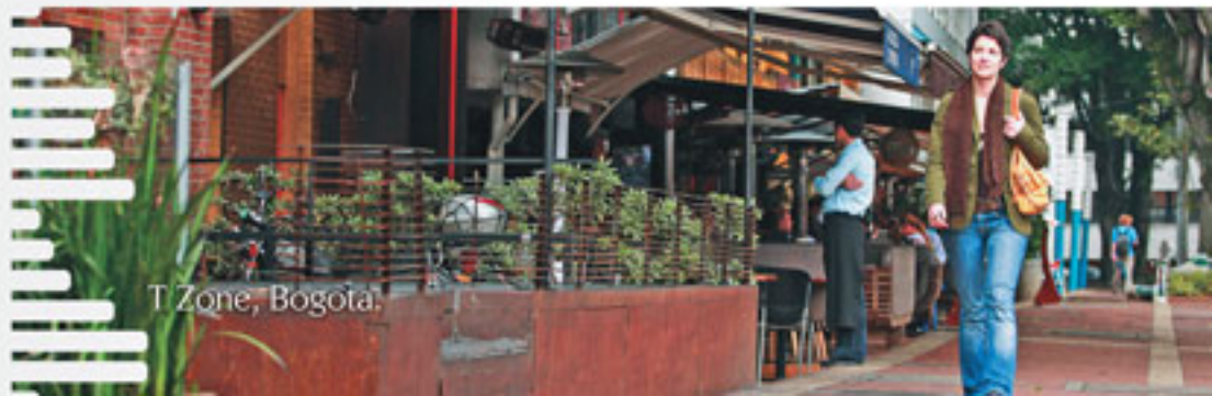
T Zone, Bogota.

The above is the name of Bogota's bullfighting ring. Since 1931, the season takes place in January and February. "La Santamaria", short for its full name, is an imposing work of architecture, which includes a museum that exhibits bullfighter's attires, bullfighting capes, and banderillas (the barbed sticks that are planted on the bull's flanks).