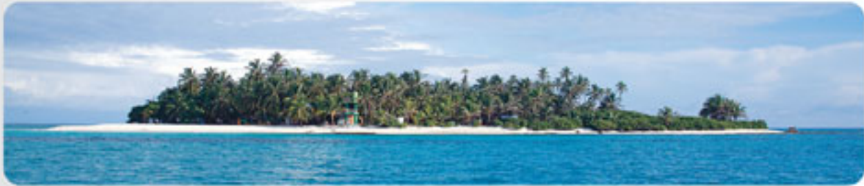
Johenry Cay - San Andres, Providencia and Santa Catalina

"So, what other reasons do you need to select Colombia for your next incentives trip? Go for a country that has it all and more. A place full of natural marvels, impassioned people, history, and adventures where you and your company will take all the credit."