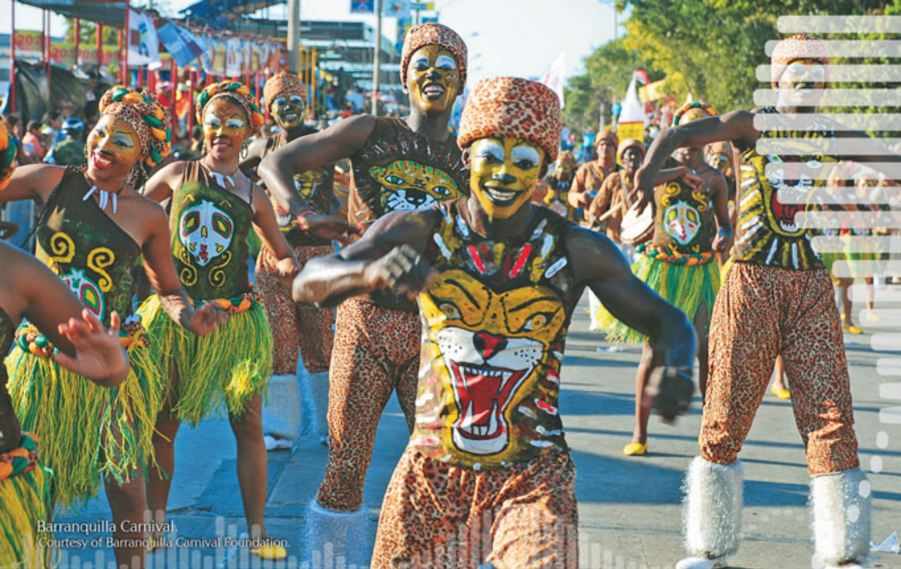
Barranquilla Carnival.