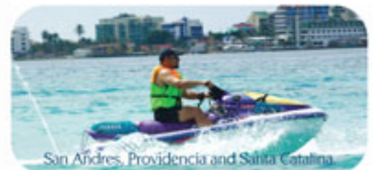
San Andres, Providencia and Santa Catalina.

Windsurfing, kitesurfing, light sailing, cruise and ski sailing, diving with or without oxygen tanks, aqua-biking, underwater and surface fishing make part of the portfolio of San Andres, Providencia and Santa Catalina.