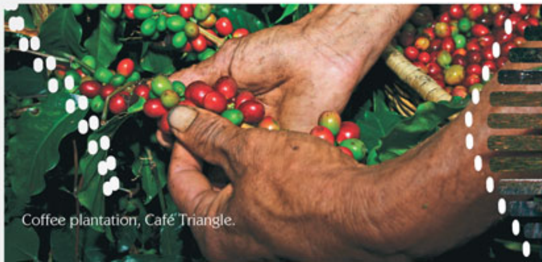
Coffee plantation, Café Triangle.

Two great products define experiences in the Café Triangle: adventure and nature.