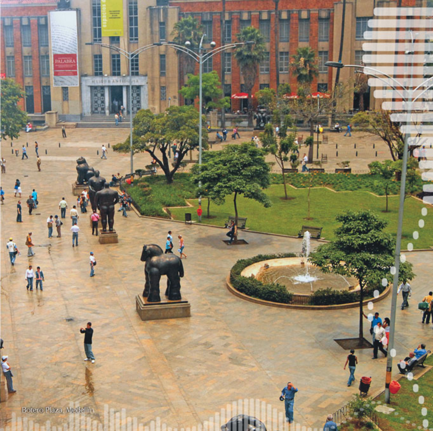
Botero Plaza, Medellín