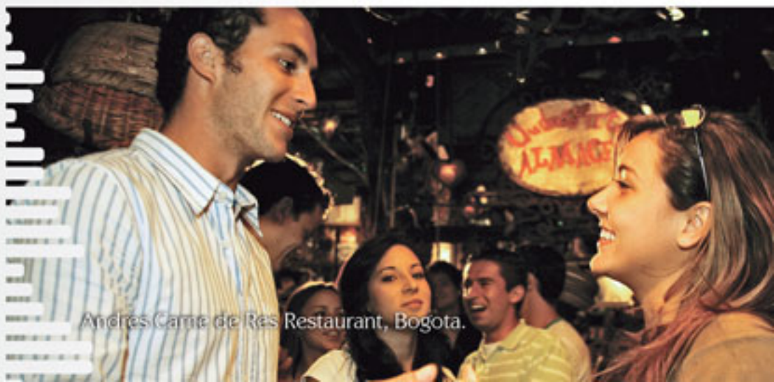
Andrés Carne de Res Restaurant, Bogota.

A cosmopolitan city, World Book Capital 2007, an average temperature of 16° C / 60° F, and 2,600 meters / 8,530 feet closer to the stars are a good choice of words for describing Bogota. Located on a high plateau on the Andes Mountains, it is the main city in the country, the seat of the National Government, and a destination par excellence for congresses and conventions. Modern and classical structures intertwine the frenzy of this capital city with the placid natural scenery that surrounds it in places like Paipa and its thermal waters and Sochagota, where it is possible to hold a sport competition.