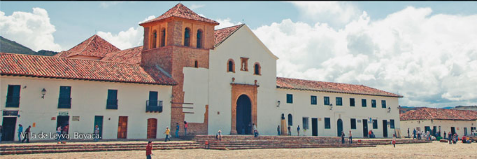
Villa de Leyva, Boyaca.