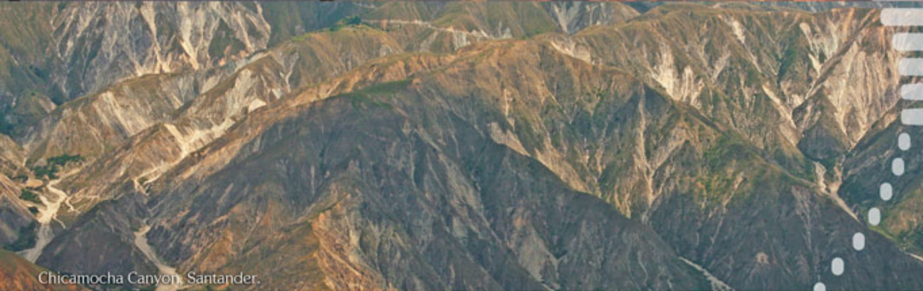
Chicamocha Canyon, Santander.