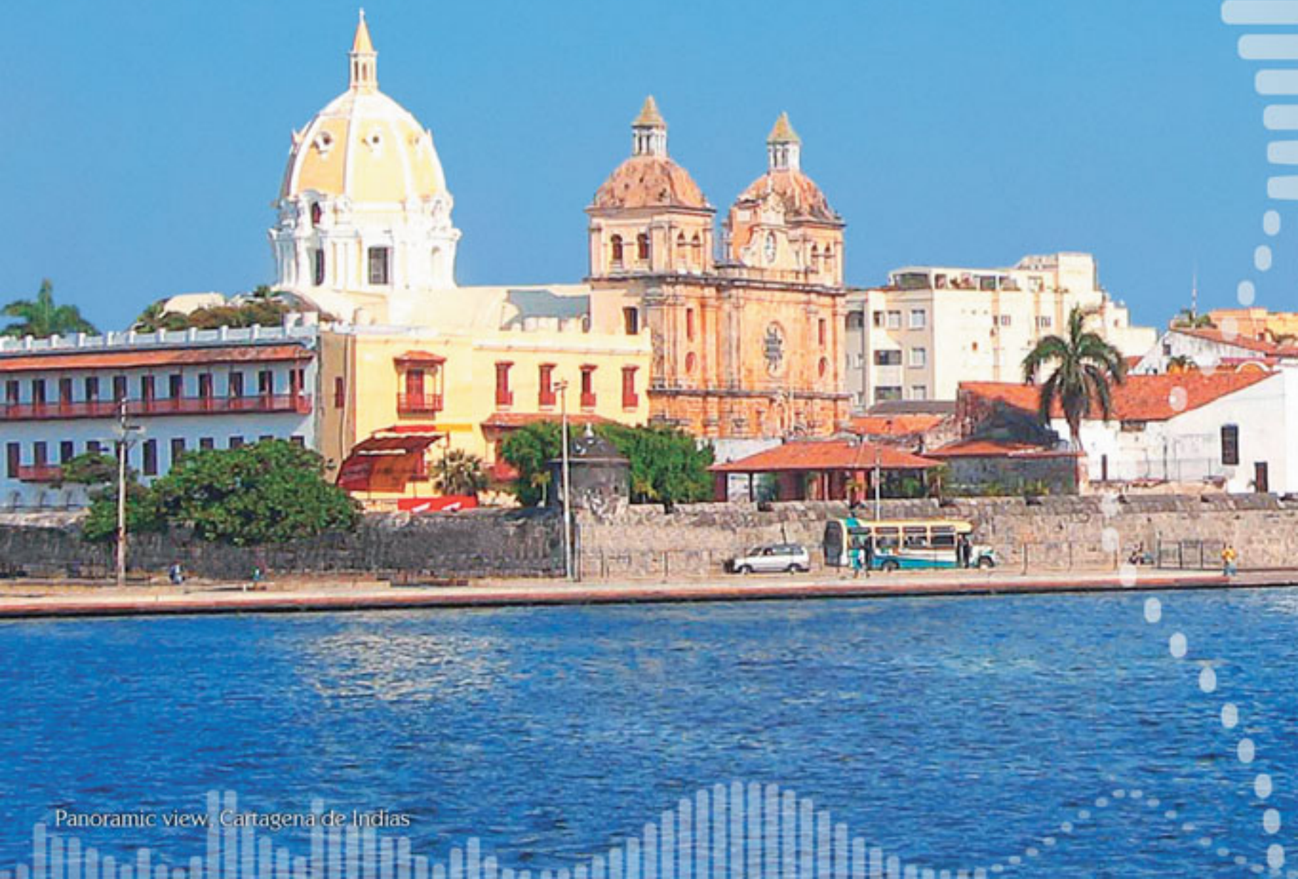
Panoramic view, Cartagena de Indias