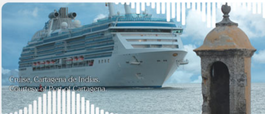
Cruise, Cartagena de Indias. Courtesy of Port of Cartagena.

Marvelous golf experiences may be enjoyed in two par-72, 18-hole courses located just twenty minutes away. Prepare yourself to brave the course and the breezes of the Caribbean.