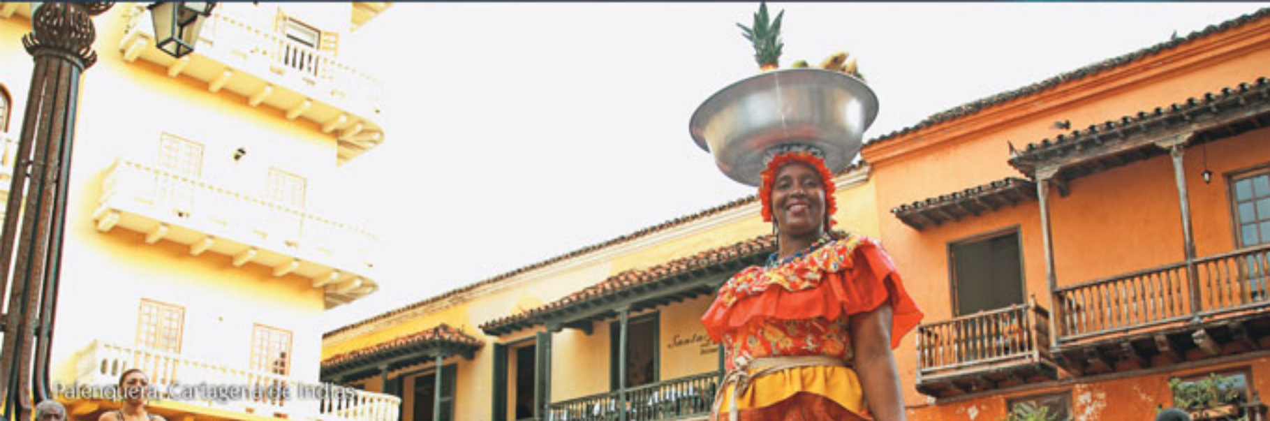
Palenquera, Cartagena de Indias.