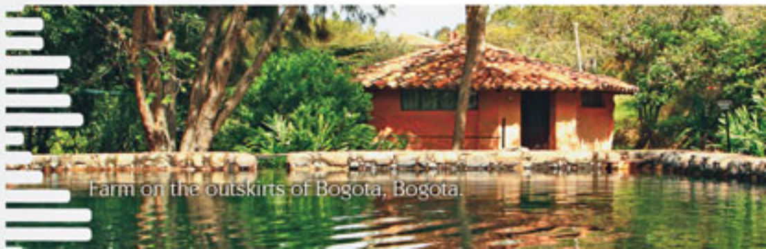
Farm on the outskirts of Bogota, Bogota.

Paintball, ascending La Gran Pared (the big wall) in Colombia's largest rock-climbing gym, trekking, canyoning, wet rappelling, rafting, recreational diving, karts competitions, and even ostrich races take place in the Department of Cundinamarca, of which Bogota is also the capital city. Sites with the specialized services for performing these activities are: Tobia, Suesca, Chingaza, and Melgar.