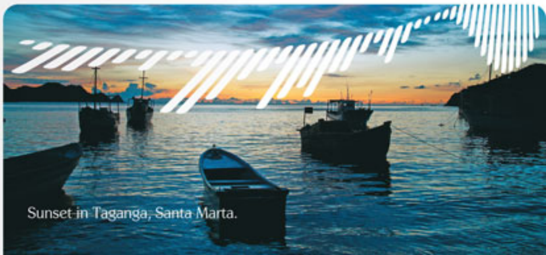
Sunset in Taganga, Santa Marta.

Mamancana Park is ideal for adventure incentive trips. It boasts 600 hectares / 482 acres of tropical dry forest and experiences in delta winging, canopying, paragliding, motor gliding, rock and tree climbing, mountain biking, rappelling, down hilling, horseback rides, diving, bird watching, and all-terrain vehicle tours. This challenging natural reserve has a lodging infrastructure with all the basic services, a camping ground, a restaurant, and places for meetings.