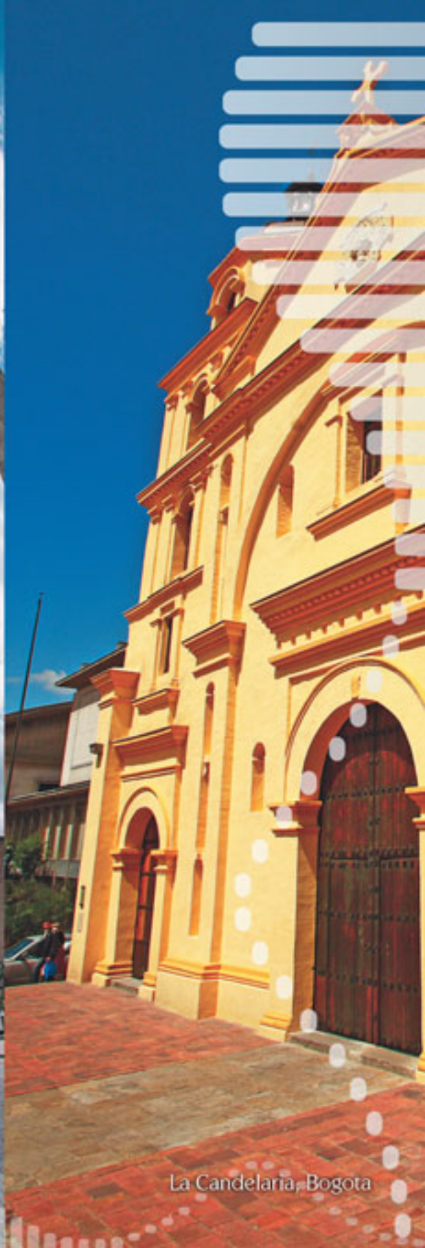
La Candelaria, Bogota