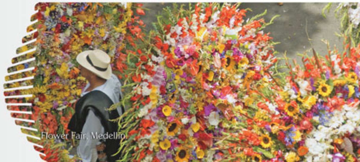
Flower Fair, Medellin

Medellin is the birthplace of great golfers. Four eighteen hole courses are located in the city and its vicinity. All were designed by renowned experts. Enjoy their beautiful landscapes while you exercise in an ideal climate.