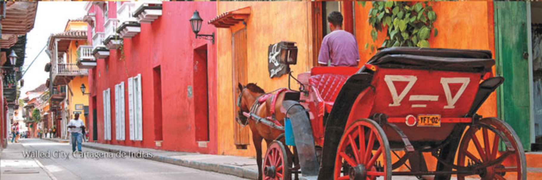
Walled City, Cartagena de Indias.