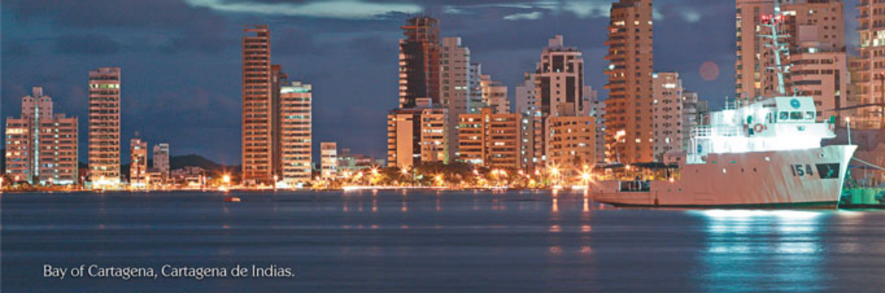
Bay of Cartagena, Cartagena de Indias.