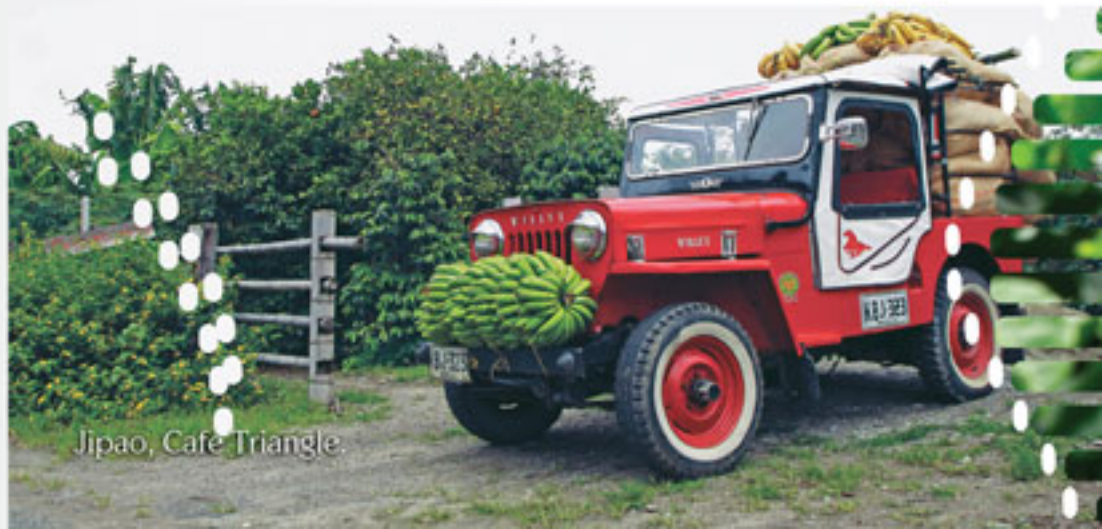
Jipao, Cafe Triangle.

Manizales welcomes every New Year with its January fair. The city fills up with bull fights, horse parades, beautiful candidates to the coffee beauty pageant, processions, cattle herding shows. A true spectacle of coffee growing traditions.